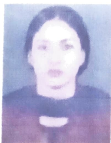
Photograph of the Candidate