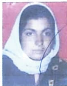
Photograph of the Candidate